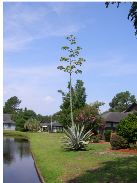
Jack Barnum's Century Plant at 201 Cedar Ridge Lane. About 20 years old and 30 feet tall. Finally blossoming!